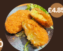
JAPANESE STYLE VEGETABLE CROQUETTE