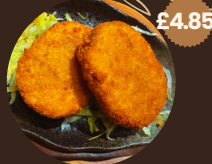
🍠PUMPKIN KOROKKE (2PCS)