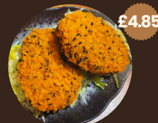
SWEET POTATO CROQUETTE (2PCS)