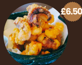
TAKO KARAAGE (OCTOPUS LEGS)