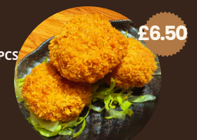
JAPANESE STYLE EBI KATSU (3 PCS)