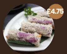
SIGNATURE CRISPY PURPLE YAM NET ROLL