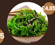
WAKAME (SEASONED SEAWEED SALAD)