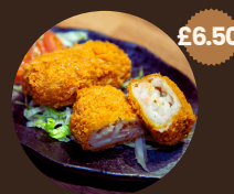
CRISPY SHRIMP CROQUETTE (2PCS)