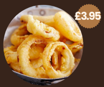
CRISPY FRESH ONION RINGS